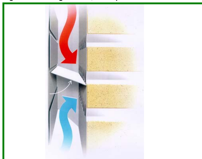
Figure 3: Cooling Shutter, Principle Sketch

The Cimbría dryer enables a varying cooling zone. Thereby the cooling of the cereal can be adjusted to the varying ambient conditions. The cooling affects the storability of the cereal. The cooling zone is regulated with a shutter placed in the bottom part of the hot air duct.